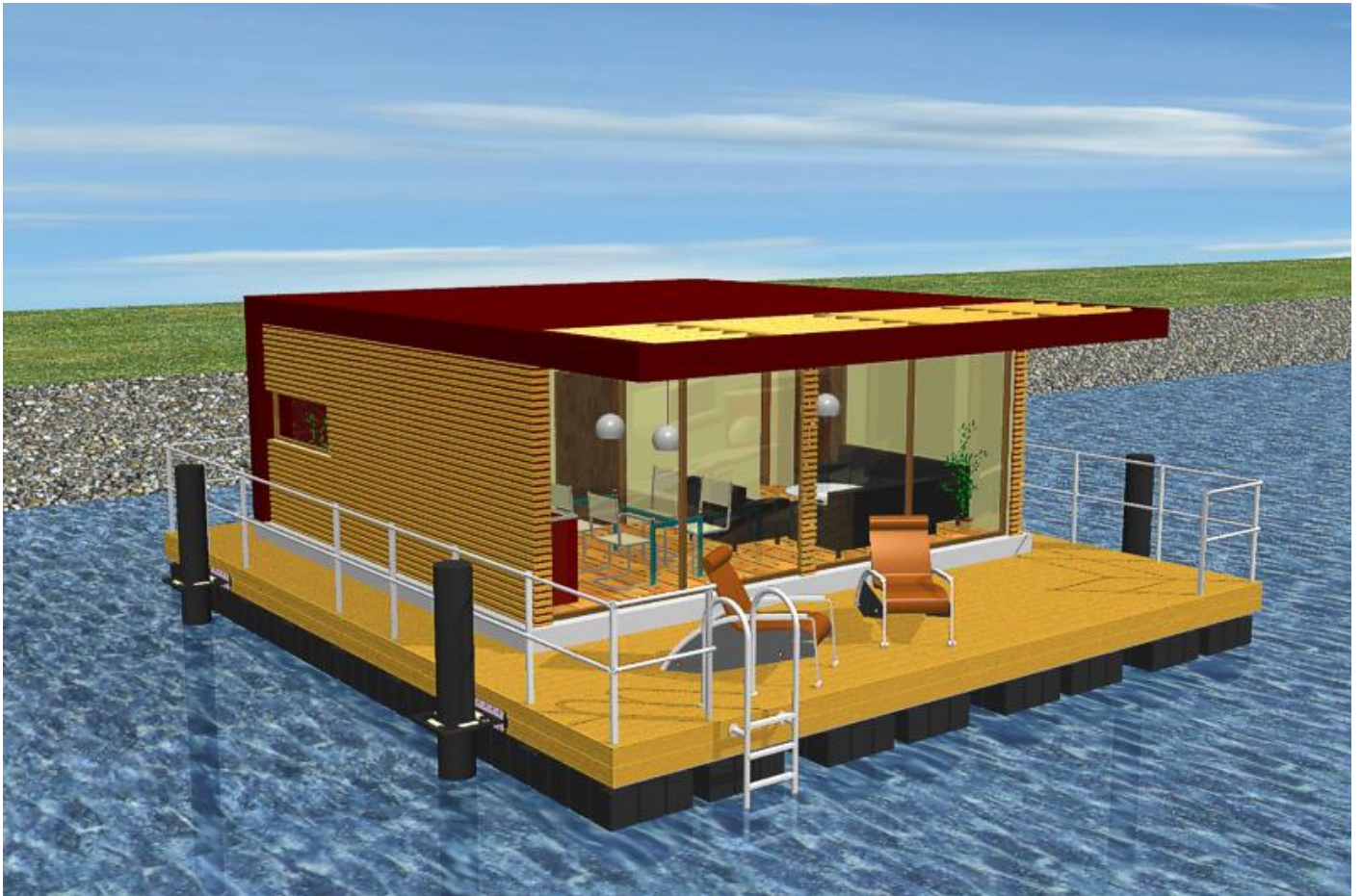
Perebo-house boats PH30 series