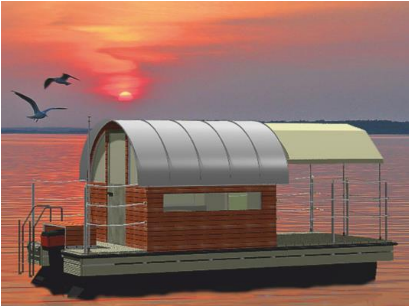
Perebo-rafts PH10 series